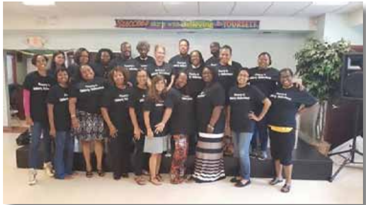
Passage Home staff sport their Holy Cow Tee's in this photo.

Raleigh, NC - Holy Cow Tee shirts can be purchased for $15 + shipping from the NCCAA. Baseball caps are also available for $10 each. Request yours today via email addressed to info@nccaa.net .