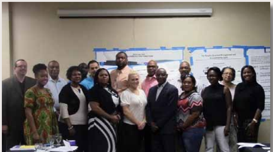
2016 NC ROMA Trainer Candidates